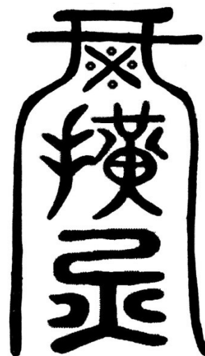
Sample Three of Wands Fu Talisman

E.g., “I, Jane Doe, will earn at least $1,000 in income per week.”